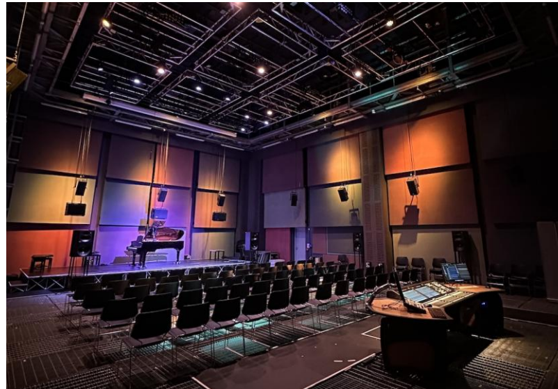
SARC Sonic Lab