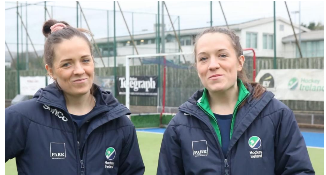
Student work: 'Broadcast Production Skills'

First Year counts towards 10% of your final degree classification