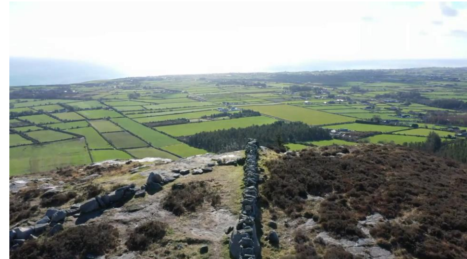
Student work: 'The Television Programme'

Interactive Media, Sonic Arts, Creative Industries, Creative Enterprise, Documentary, Radio Drama