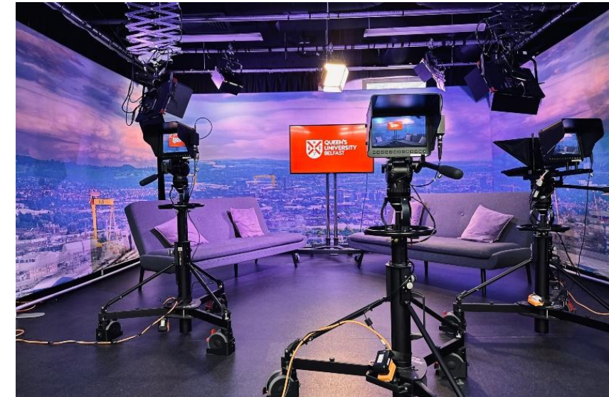
SARC TV Studio